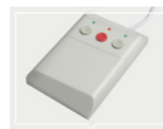
Control panel for remote management